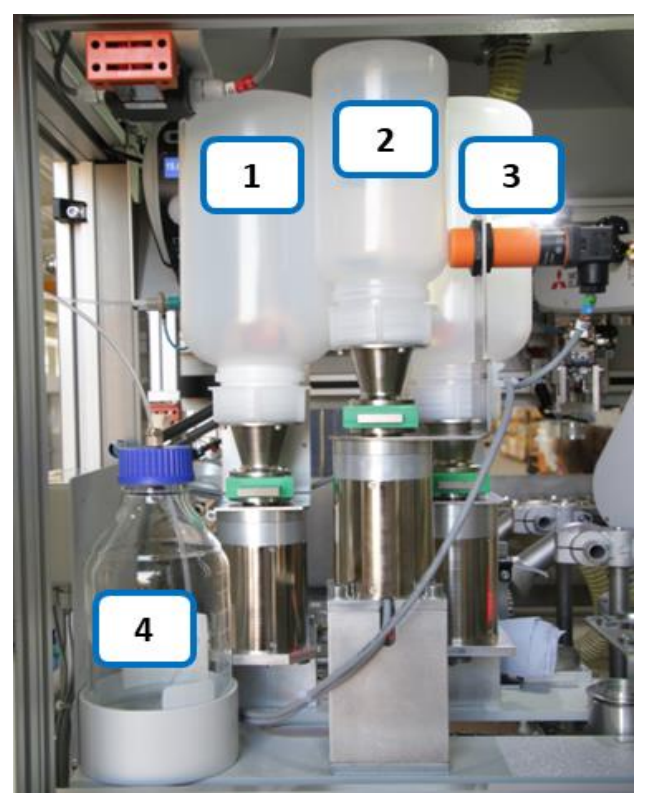
Figure 1: Detail photograph of the dosing unit of the HAG-HF with bins for (1) internal standard, (2) oxidizer, (3) borate flux, (4) liquid dosing of non-wetting agent.

The storage bins of the powders are effectively protected against the humidity of the air by builtin pinch valves (Figure 2). The weighing is performed by a balance placed underneath the storage bins with an accuracy of 0.1 mg. A specially developed PLC algorithm allows the fast and precise dosing and can be easily adapted to the particular properties of each material.