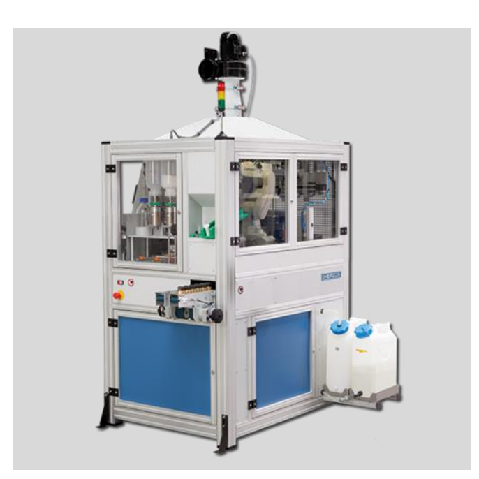
Figure 1: Automatic high-frequency fusion system model HAG-HF for XRF sample preparation. The machine also includes the dosing unit used for this study.

For this test series we used a HAG-HF model (Figure 1) with a dosing unit that can handle three different powders like, e.g., an internal standard, oxidizer and borate flux.