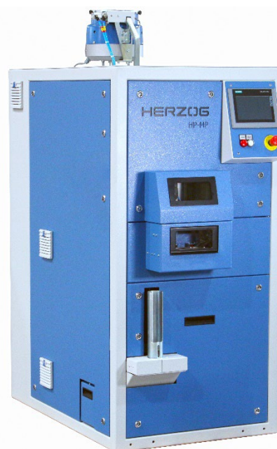
Figure 2: Mill and press combination HP-MP for the preparation of pressed pellets suitable for XRF analysis.

The rutile sample is mainly composed of TiO 2 with an average concentration of 94.47%. Here a standard deviation of 0.07 was obtained for the tested sample set. Minor present elements like SiO 2 , CaO, Fe 2 O 3 with an average concentration of less than 1.5 % have a standard deviation of maximum 0.04.