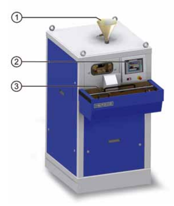
Fig.1: The automatic mill HP-MA configured for a combined cleaning with sand and compressed air.

This note will present main parameters of sample preparation and show the capability for processing samples with widely varying grades of copper on a single grinding machine.