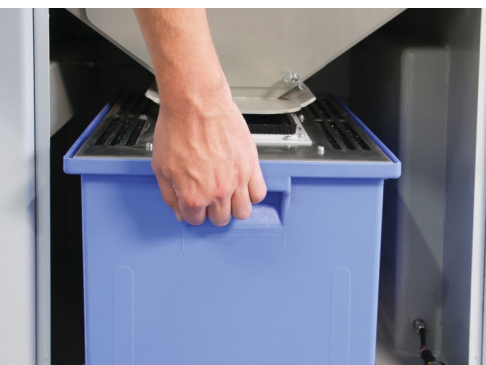
Easy to remove collection container for chips