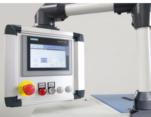
Easy to adjust support arm system of the control panel