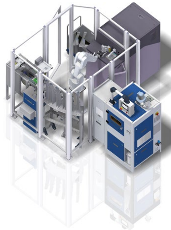
HERZOG MetalLab- The standard automation for preparation and analysis of non-ferrous samples.

The use of modern sensor technology enables, for example, to monitor the machine bearings and the condition of the cutting inserts. Automatic data evaluation is performed with the help of our PrepMaster Analytics software, which provides the operator with a comprehensive overview of the machine's condition.