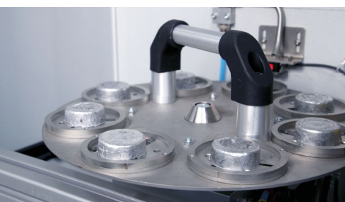
Eight-position turntable magazine for batch processing